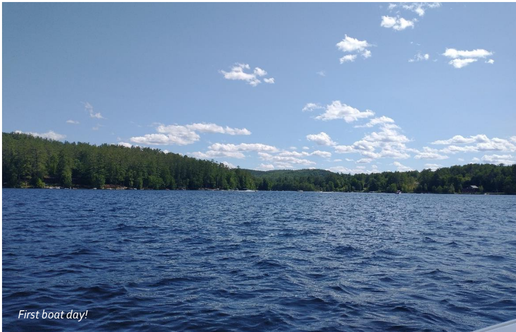
First boat day!

AT BIRCHWOOD, WE WANT YOU TO FEEL AT HOME!