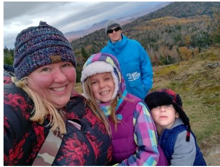
Gore Mtn – October 2022

Every year during Columbus Day weekend, Gore has a "Harvest Fest"! It includes local vendors, food, music, and fun! We try to make it to see the beautiful peak leaves, the vendors, enjoy the food, music, and time together! This year did not disappoint, and we were able to bring some friends with us! It's always a magical (albeit chilly) view when you take the gondola ride to the top!