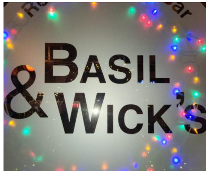
Basil & Wicks, North Creek – January 2023